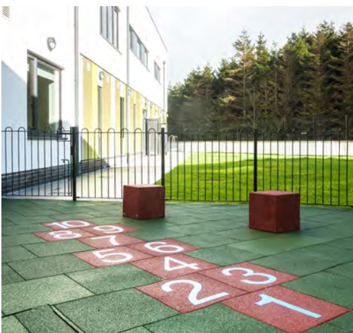
Children's external play area with hopscotch markings.