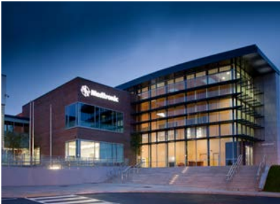
Medtronic Customer Innovation Centre