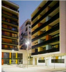
Heuston South Quarter