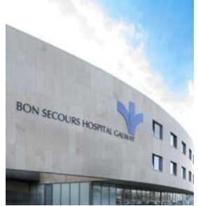
Bon Secours Hospital