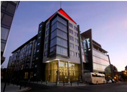
Radisson Golden Lane