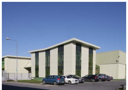
Galmere Fresh Foods