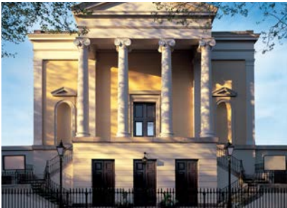
Adelaide Road Church