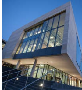
NUIG AHSSRB Building