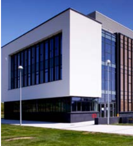
NUIG Science Research Building