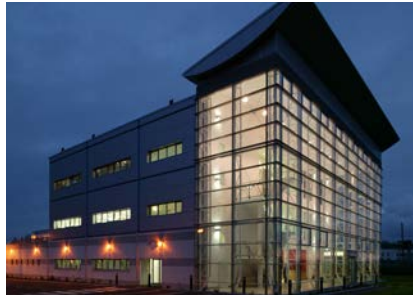
Creganna Medical Devices