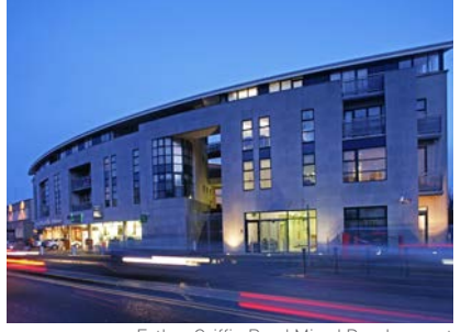
Father Griffin Road Mixed Development