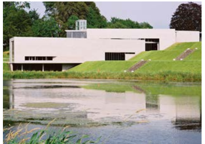
National Museum of Ireland, Country Life