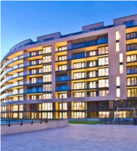
The Grange Development