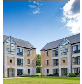
Student Accommodation Merville, UCD