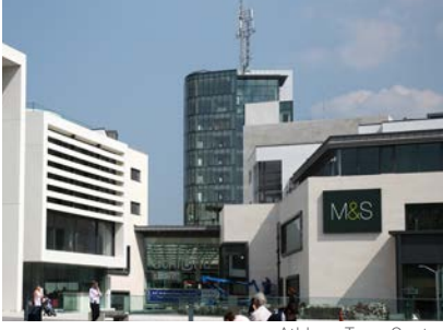
Athlone Town Centre