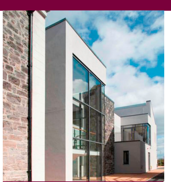
Client Name : Health Service Executive